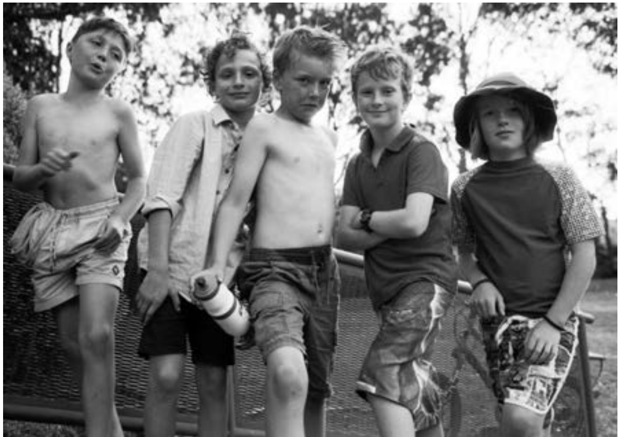
Figure 4: Grade 4 and 5 boys