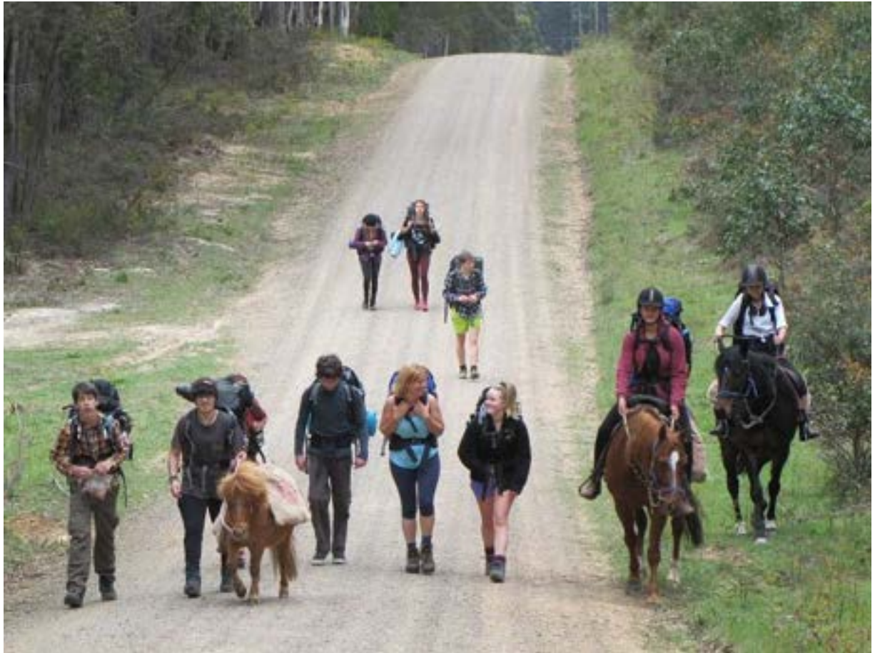
Figure 1: Year 9 hike with horses

One day I blinked and the next thing I knew, Candlebark was ten years old. How did that happen?